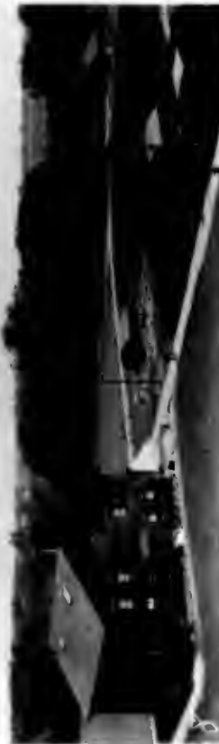
Horticulture Building, Home of the Viticulture and Enology Department, 1919-23 and 1952-59. This photograph, taken in 1921 also shows the newly constructed Nursery and Grafting House near the banks of Putah Creek.